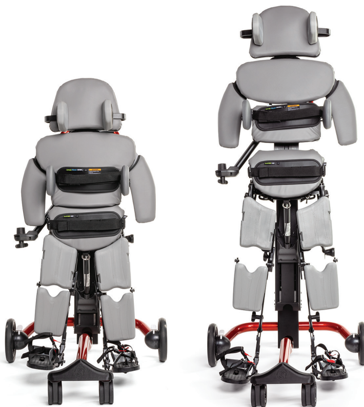
Size 3 Stander at its smallest and largest settings